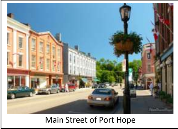
Main Street of Port Hope

Enjoy a leisurely summer's day in Northumberland County reliving its historical roots with local guide, Peter Brotherhood. Spend time in the late-Loyalist town of Port Hope , famous for its