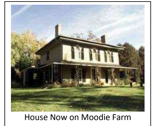
House Now on Moodie Farm

Township, we visit the site of Susanna Moodie 's homestead where she wrote, 'Roughing it in the Bush'; in her own words, we discover some of her favourite characters who lived here in 1832.