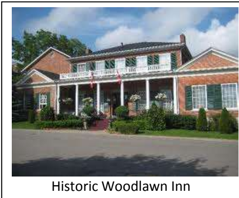
Historic Woodlawn Inn

well preserved main street, its numerous antique shops and its beautiful heritage homes. Hear about the tragic but inspirational life of Joseph Scriven , 'the Good Samaritan' of the town in the 1800's and about the circumstances which caused him to write his famous hymn, 'What a Friend We Have in Jesus'. Local resident, Farley Mowat has been honoured by the Overturned Boat Monument. In Hamilton